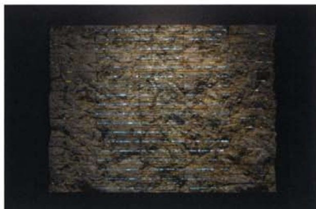
Stone & Glass sculpture by Otto Rigan