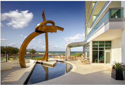
Guy Dill, Bronze, Close Hauled , North Side of Hotel, Regent Bal Harbour